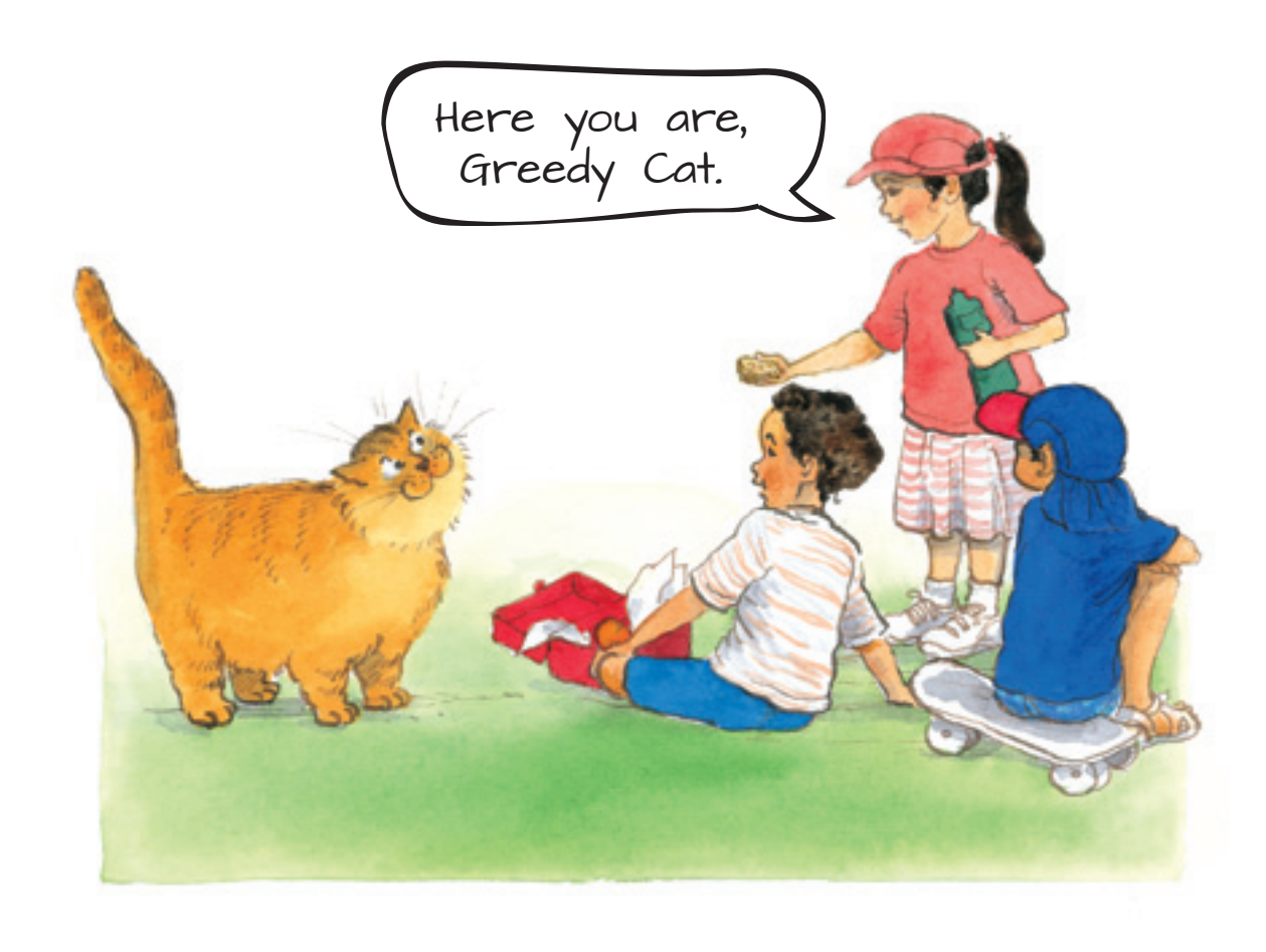
"Look!" said the children. "Greedy Cat is hungry. He wants some lunch."