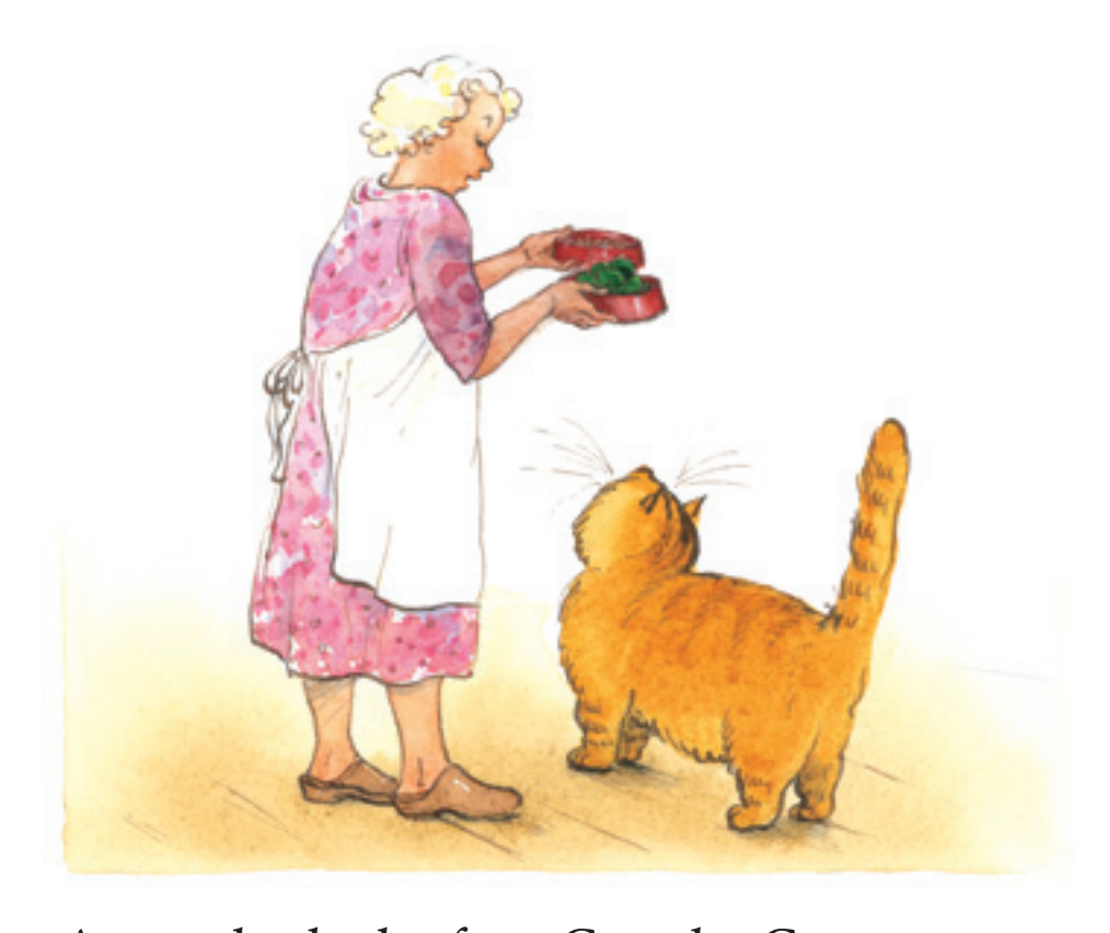
Aunty looked after Greedy Cat. "Cat! You are too fat!" said Aunty. "Here is your lunch." She gave him cat biscuits and some broccoli.