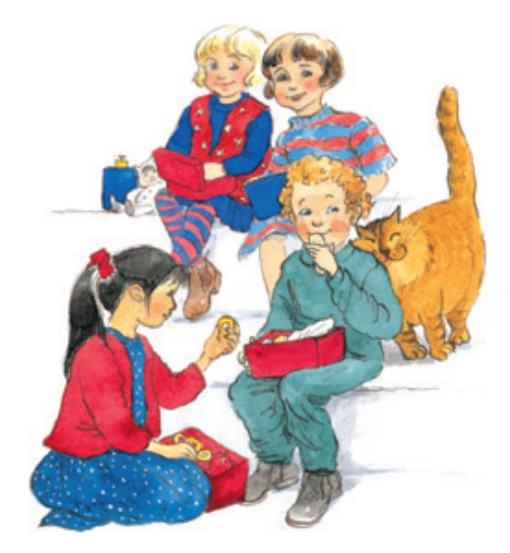
Day after day, Aunty gave him cat biscuits and broccoli. Day after day, Greedy Cat went to school, and the children gave him lunch.