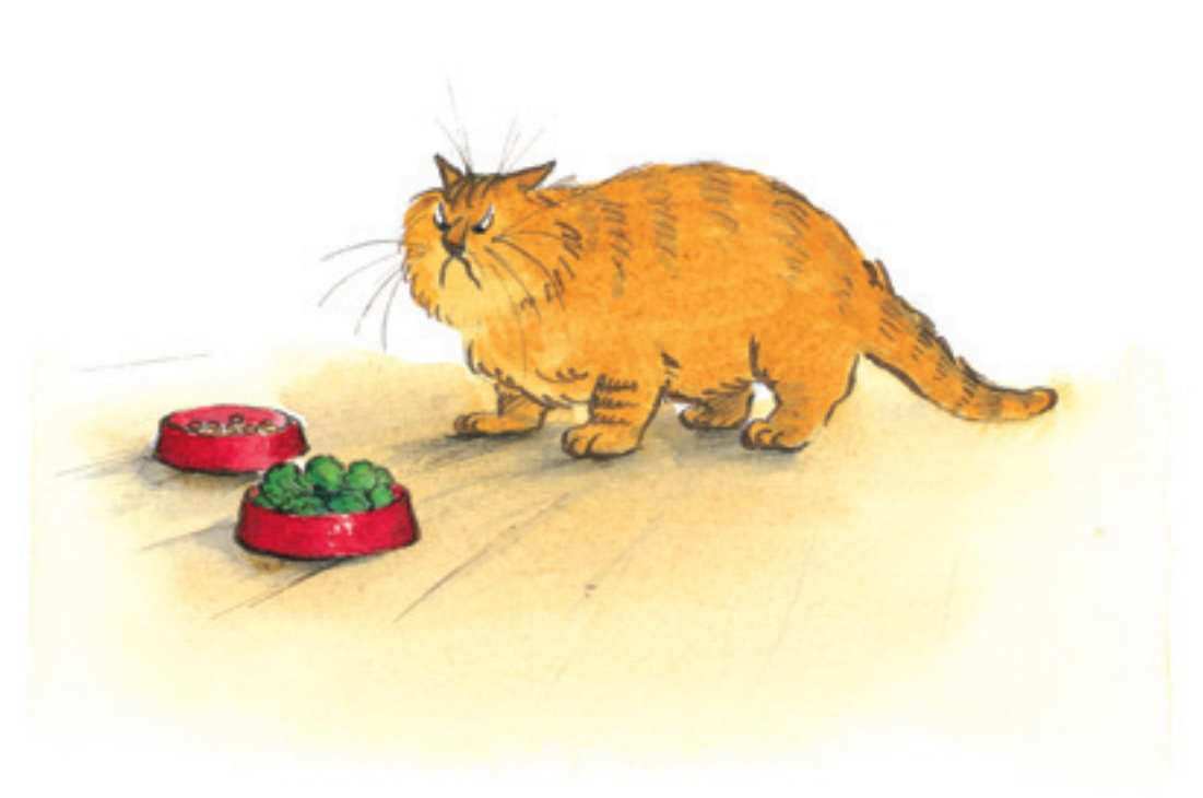
The next day, Aunty gave Greedy Cat his lunch. Cat biscuits and broccoli again! Off went Greedy Cat. He went back down the road and into the school.